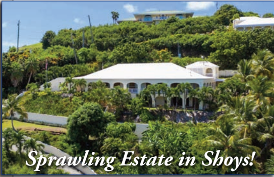
Sprawling Estate in Shoys!