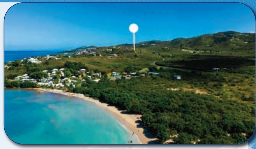
Listings courtesy of David Fedeles

64 GREEN CAY : 66 GREEN CAY MLS 21-61 | $135,000 : MLS 21-62 | $95,000 TWO MISS BEA BEAUTIES! Spectacular building sites! 64 Green Cay is just over .5 acres and 66 Green Cay is just under .5 acres, both in the coveted Miss Bea Subdivision, the ideal place to build your own private escape. Gorgeous views from Green Cay, Pull Point and all the way to Christiansted town with north easterly winds for cooling breezes. Relax as the sun sets over town and watch the stars twinkle in the moonlight from the gallery of your custom built island dream home.